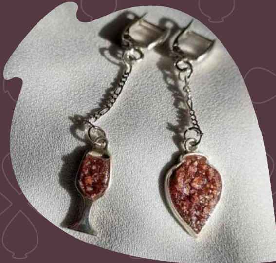
Pink Rkatsiteli Harvest 2021. Kakheti, Georgia