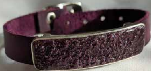
Saperavi wine crystals Harvest 2021 (Mukuzani micro zone) Kakheti, Georgia.