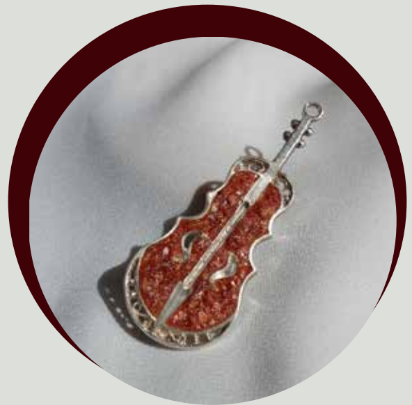
Pink Rkatsiteli Harvest 2021. Kakheti, Georgia