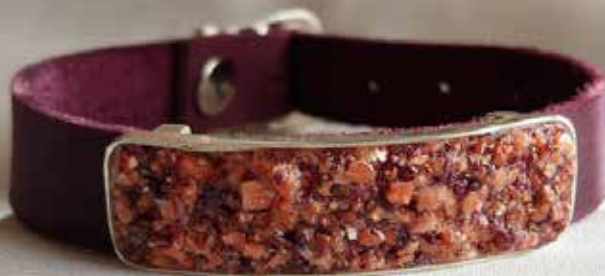
Mix of Pink Rkatsiteli and Mukuzani Saperavi Harvest 2021. Kakheti, Georgia