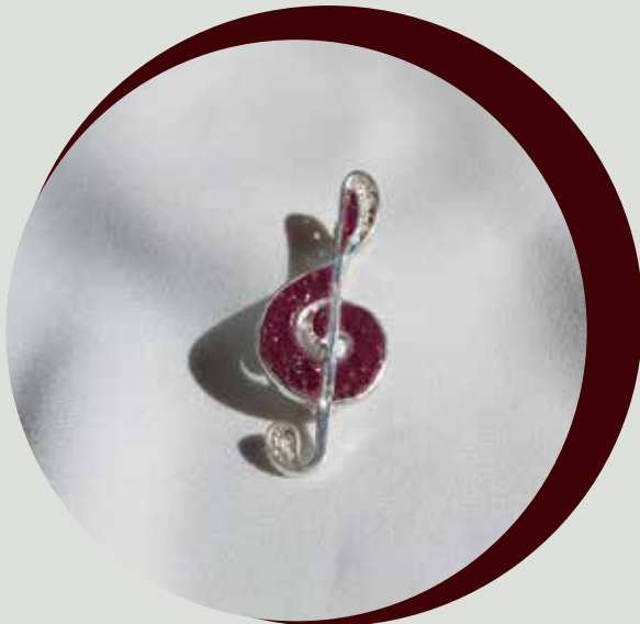
Budeshuri Saperavi wine crystals Harvest 2022. Kakheti, Georgia.