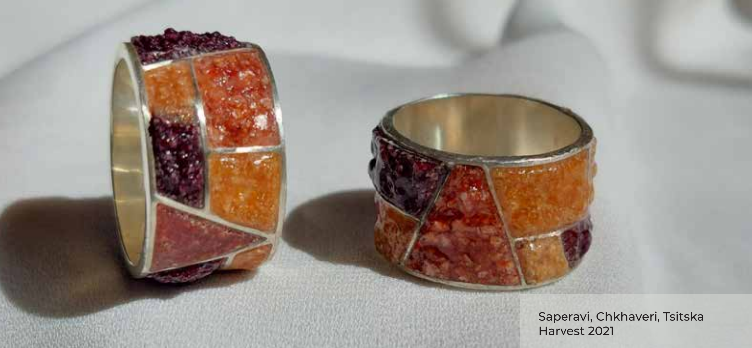
Saperavi, Chkhaveri, Tsitska Harvest 2021