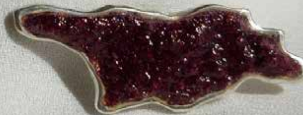
Saperavi wine crystals Harvest 2021 (Mukuzani micro zone) Kakheti, Georgia.