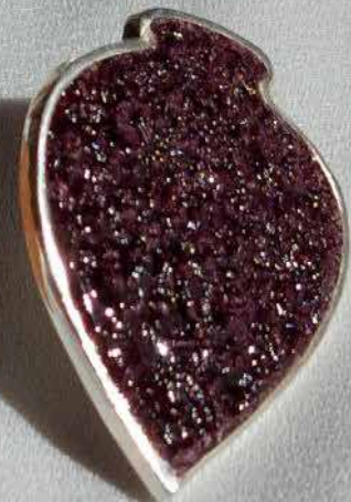
Chkhaveri wine crystals harvest 2021. Guria, Georgia.