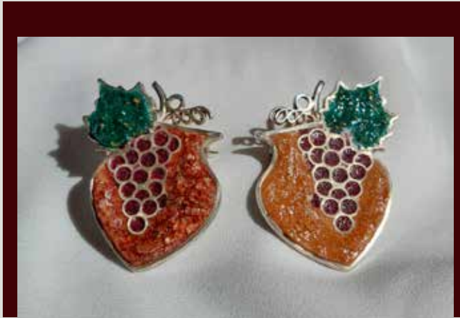
Kisi wine crystals Harvest 2019. Kakheti, Georgia