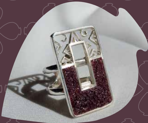
Saperavi wine crystals Harvest 2021. (Mukuzani micro zone) Kakheti, Georgia.