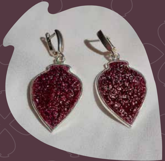
Saperavi wine crystals Harvest 2021. (Mukuzani micro zone) Kakheti, Georgia.