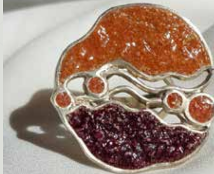
Tsitska wine crystals Harvest 2021. Imereti, Georgia. & Saperavi wine crystals Harvest 2021. Kakheti, Georgia.