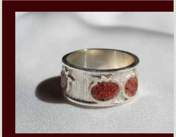
Chkhaveri wine crystals harvest 2021. Guria, Georgia