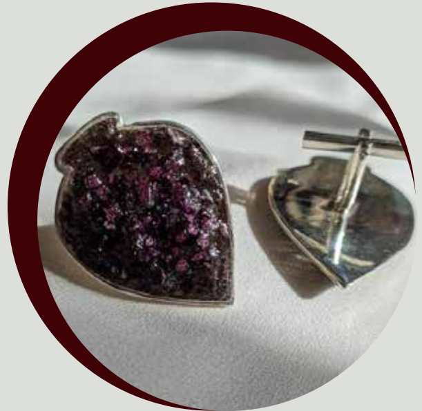
Saperavi wine crystals Harvest 2020. Kakheti, Georgia.