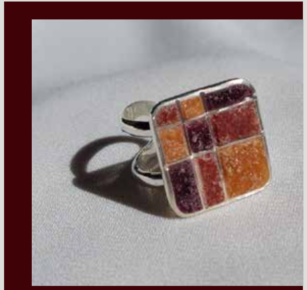
Saperavi, Chkhaveri, Tsitska Harvest 2021