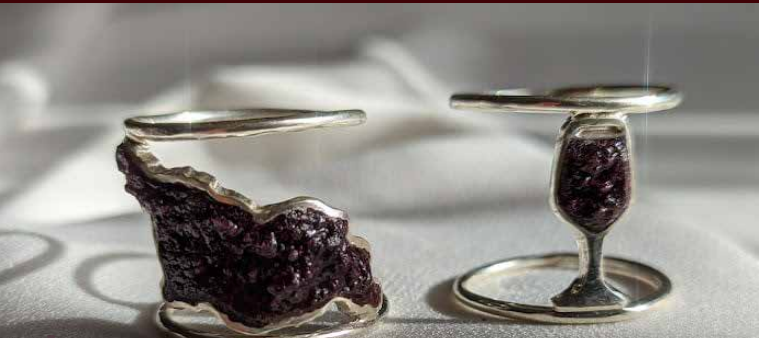
Saperavi wine crystals Harvest 2020. Kakheti, Georgia.