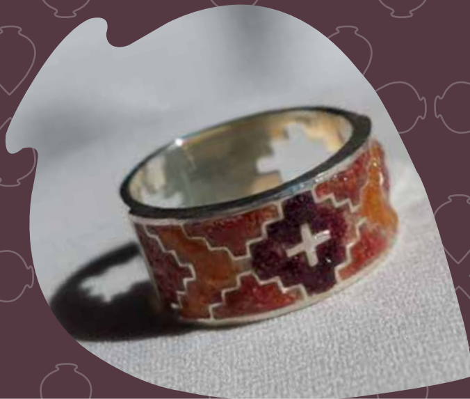
Saperavi, Chkhaveri, Tsitska Harvest 2021