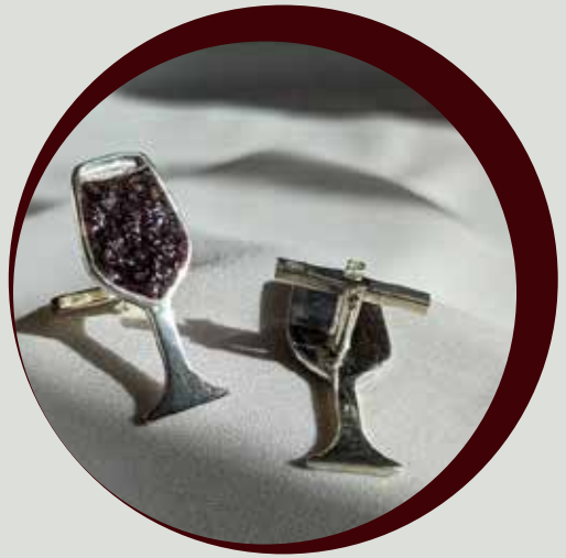
Saperavi wine crystals Harvest 2020. Kakheti, Georgia.