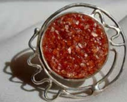
Pink Rkatsiteli Harvest 2021. Kakheti, Georgia