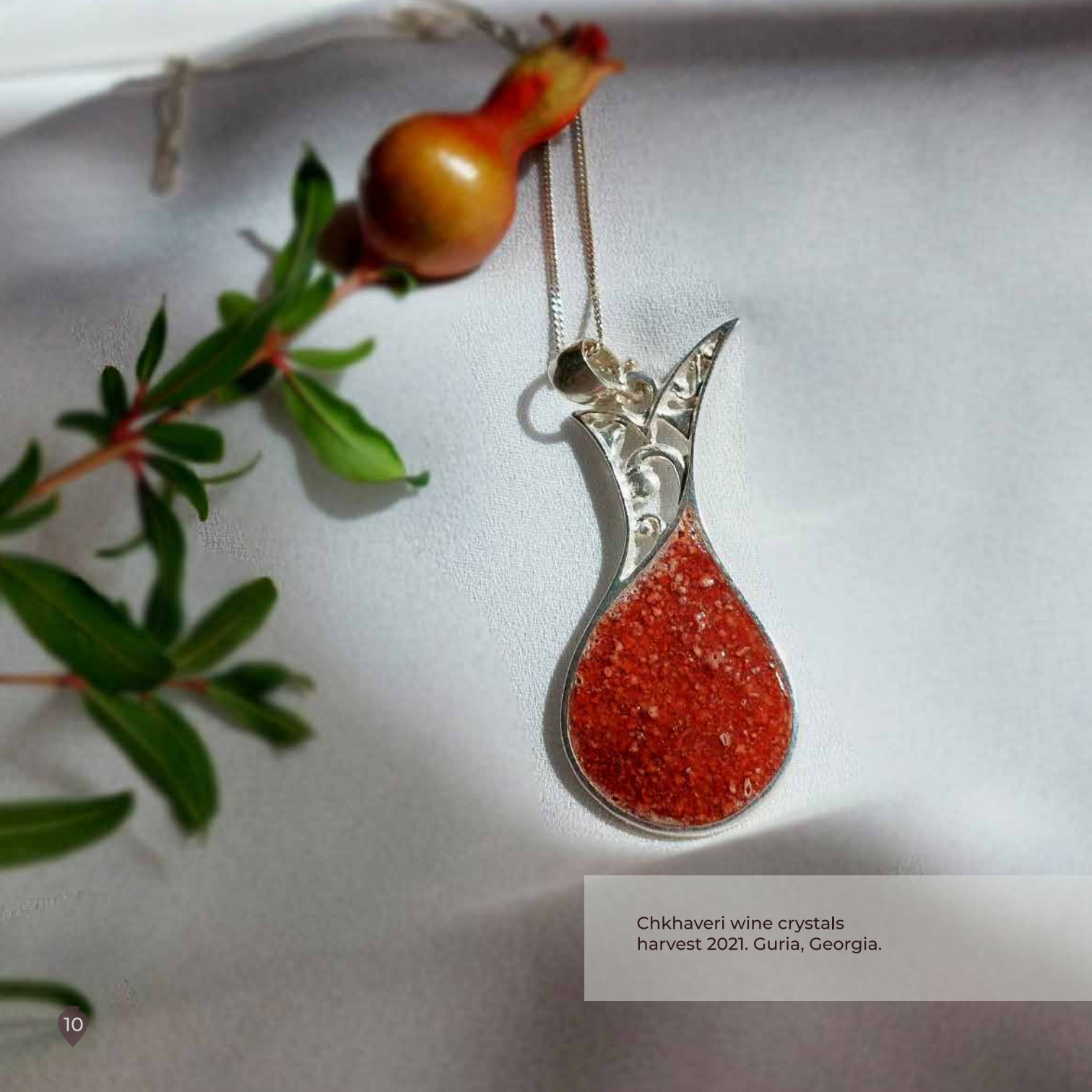
Chkhaveri wine crystals harvest 2021. Guria, Georgia.