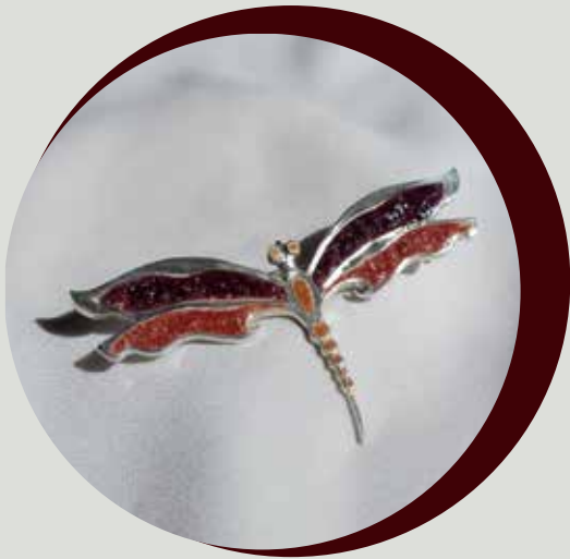
Saperavi wine crystals Harvest 2021. (Mukuzani micro zone) Kakheti, Georgia. & Chkhaveri wine crystals harvest 2021. Guria, Georgia.