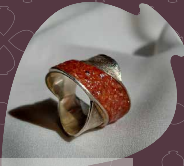
Pink Rkatsiteli Harvest 2021. Kakheti, Georgia.