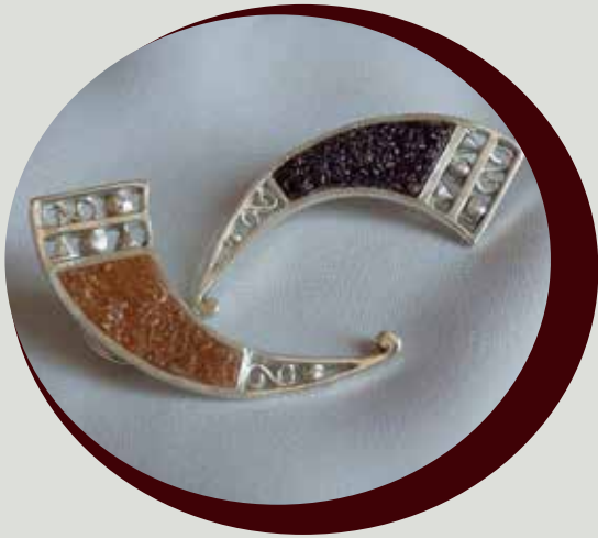
Saperavi wine crystals Harvest 2021. (Mukuzani micro zone) Kakheti, Georgia. Tsitska wine crystals. Harvest 2021. Imereti, Georgia.