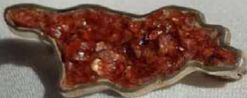
Chkhaveri wine crystals. harvest 2021, Guria, Georgia.