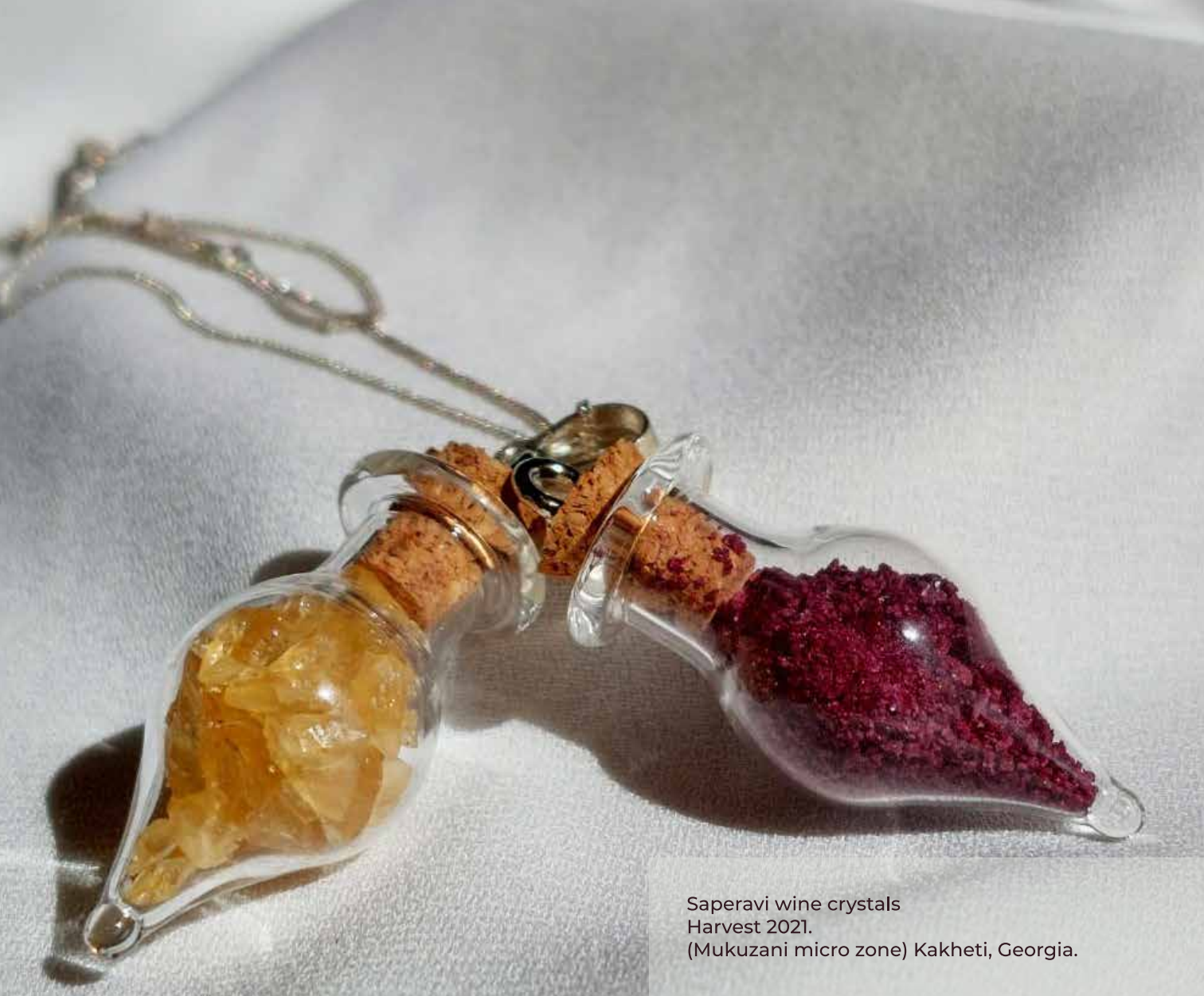
White Rkatsiteli wine crystals Harvest 2020. Kakheti, Georgia.