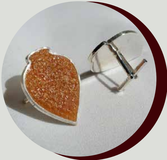
Tsitska wine crystals Harvest 2021. Imereti, Georgia.