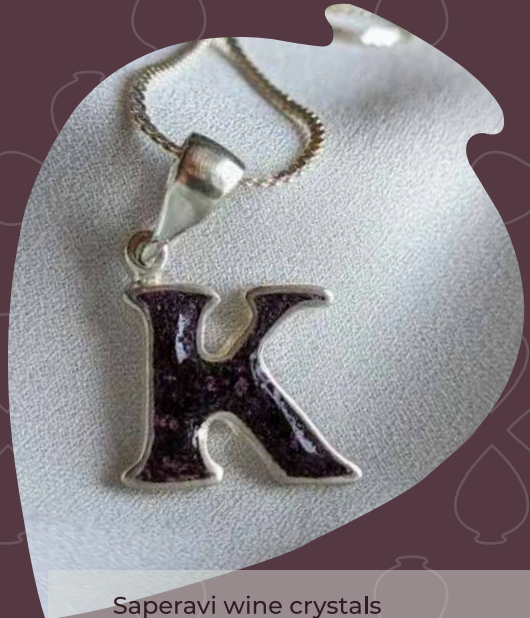
Saperavi wine crystals Harvest 2021 (Mukuzani micro zone) Kakheti, Georgia.