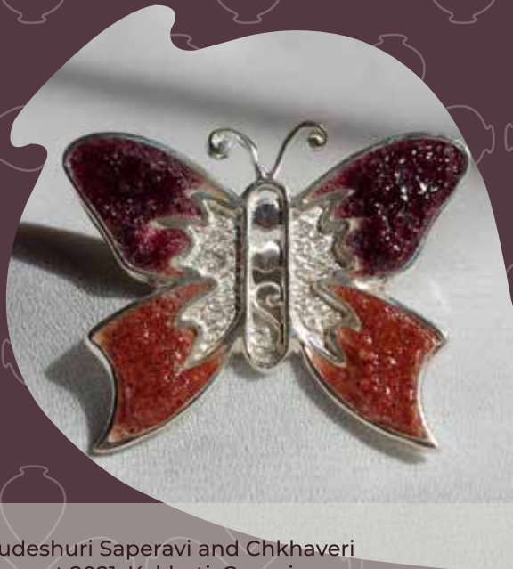
Budeshuri Saperavi and Chkhaveri Harvest 2021. Kakheti, Georgia.