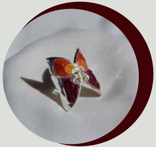
Saperavi wine crystals Harvest 2021. Kakheti, Georgia. & Chkhaveri wine crystals harvest 2021. Guria, Georgia.