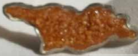
Tsitska wine crystals. Harvest 2021. Imereti, Georgia.